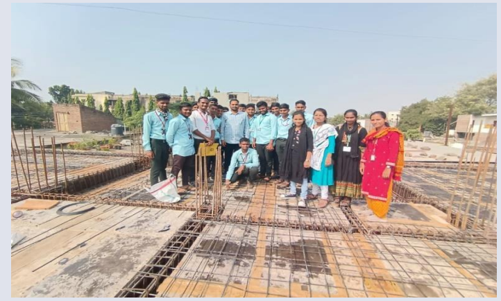
Industrial Visit at Bridge Construction, Velapur

Industrial visits provide the students with an opportunity to learn practically through interaction, working methods and employment practices. It gives the students an exposure to current work practices as opposed to theoretical knowledge being taught at their college classrooms.