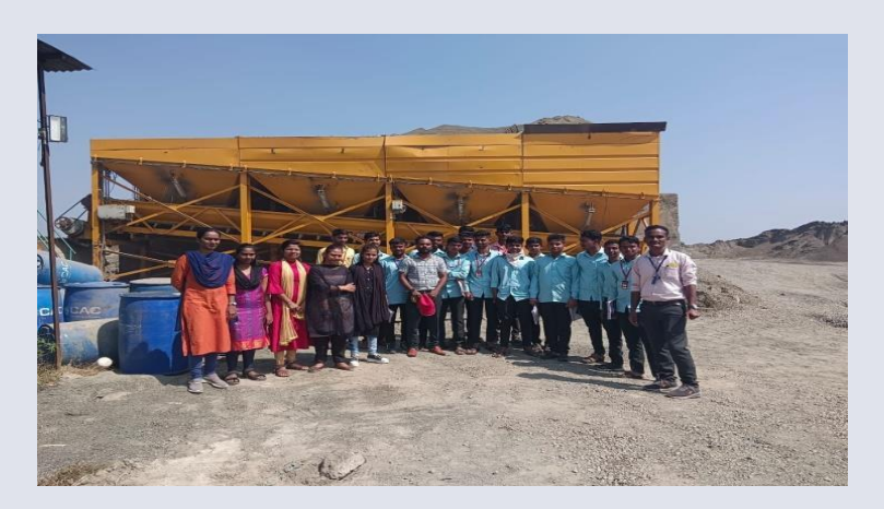
Industrial Visit at Ready Mix Concrete Plant

On 03 November 2022 an industrial visit was organized by department of Civil Eng. To Bridge Construction at Velapur, for Second & third year students as a part of curriculum. The visit was helpful to enhance the knowledge about the Highway Engineering.